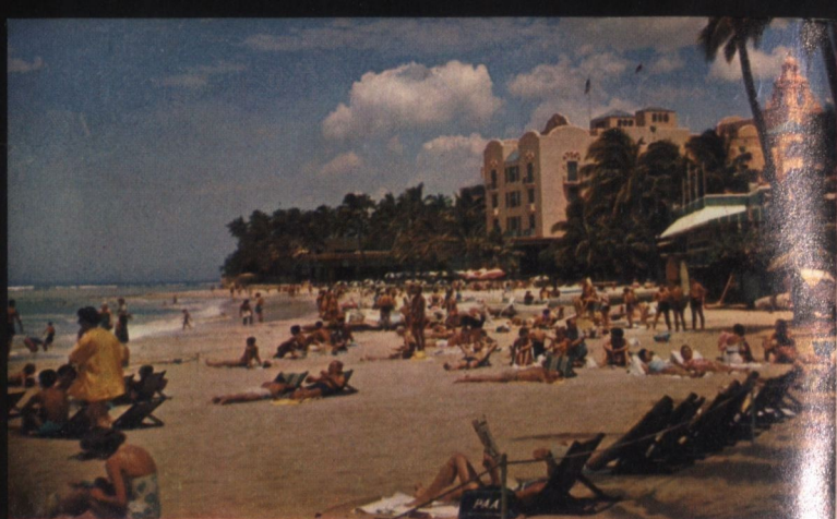
On the beach at Waikiki.